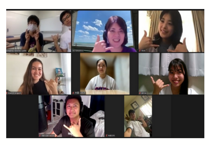
April 2022 Topic: Mythology

The V-PAL program exemplifies educational innovation, offering students a platform for language learning, cultural exchange, and the formation of global friendships. This initiative between Hilo and Kumejima High Schools has set a strong foundation for future exchanges, promoting language proficiency, cultural awareness, and a deeper global understanding.