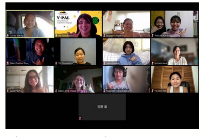
February 2022 Topic: Valentine's Day