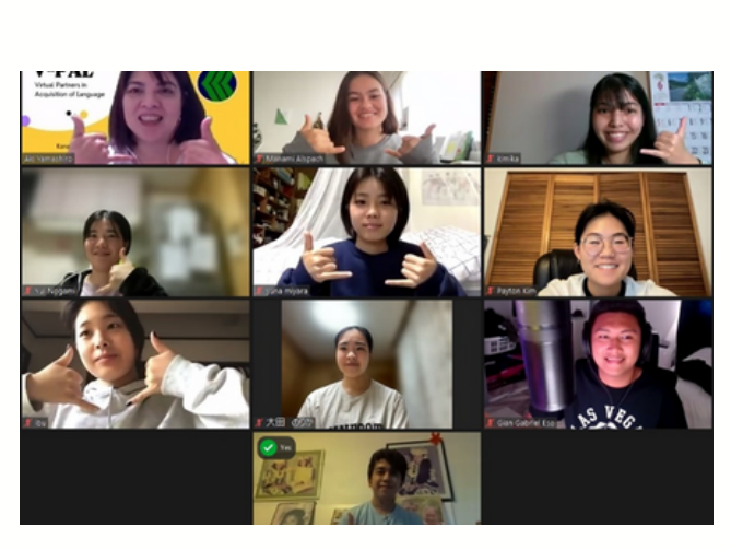
March 2022 Topic: Graduation and Future Plans

The V-PAL program, a pioneering venture in educational innovation, initiated its journey with Hilo High School in Hawai'i County and Kumejima High School in Japan as its first participants. This collaboration involved 14 students from both schools, engaging in a five-month cultural and linguistic exchange from January to May 2022. Through the use of Zoom, these students met virtually once a month, diving into discussions about their cultures, differences, and similarities, underlining the program's commitment to fostering understanding and language skills in English and Japanese.